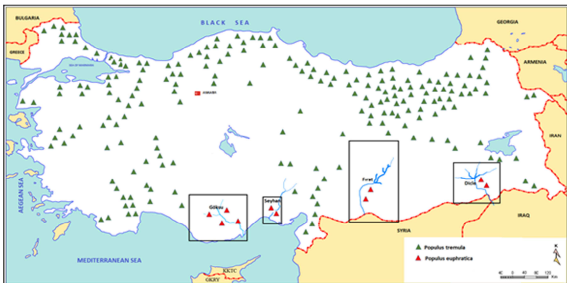
Figure 1. Distribution of Euphrates poplar (as four population) and Aspen (▲) in Turkey.

Aspen ( Populus tremula ) is being ranged in large area in Turkey and can be encounter between the altitudes of 0-2700m as small stands, groups, and individuals. Aspen have a wide range of distribution area in Turkey, approximately 133.716,98 ha. This land is characterized as productive high forest and remaining area of 57.217,78 ha. is considered as degraded high forest. The broadest range of Aspen trees is seen in the Regional Directorates of Trabzon (36.603,20 ha), Erzurum (31.777,90 ha) and Giresun (20.878,70ha), respectively. That is particularly focused on its ability to withstand high salinity, Euphrates poplar's natural ranges over the world are greatly diminished. Two most important natural ranges of the species are Tigris and Euphrates rivers. Distribution of Euphrates poplar and Aspen in our country are shown in Figure 1.